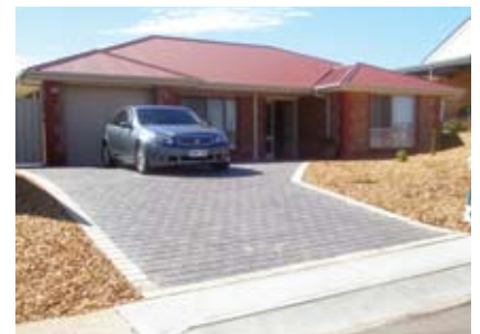
One of the new community homes on Hillier Road, Reynella