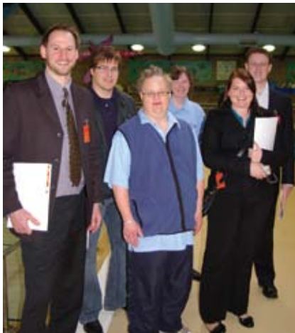
GHD 'Young Professionals' visiting Supported Employees at Minda's Aquatic Centre

This year, celebrating its 80th birthday, the Adelaide branch of international professional services company, GHD, held a cocktail evening on Thursday 28 August. Very much a community-minded organisation, staff at GHD saw a link with Minda, which is celebrating its 110th anniversary, and chose to donate $10 to Minda for every person who attended GHD's cocktail evening.