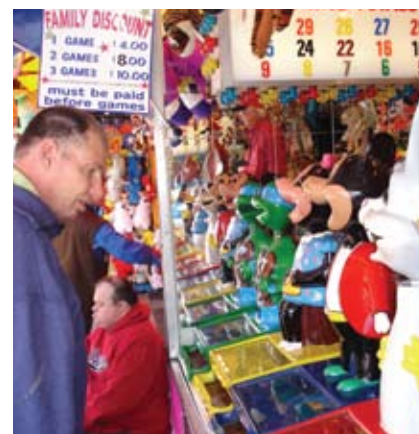
Clients enjoying a day out at the Royal Adelaide Show

Minda sincerely thanks the Royal Agricultural & Horticultural Society of SA, on behalf of clients and staff, for the kind donation.