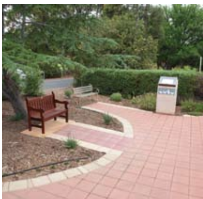
The Peace Garden of Remembrance

It was a very special evening on Wednesday 18 November as family, friends, volunteers, staff and individuals supported by Minda gathered at Brighton to open the new Peace Garden of Remembrance.