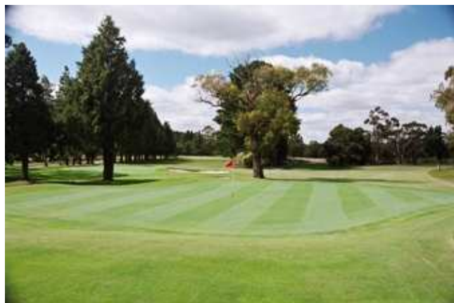
6 th Green