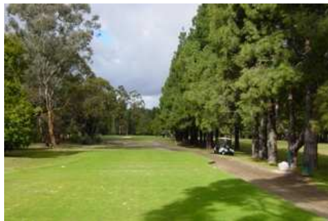
3 rd Hole