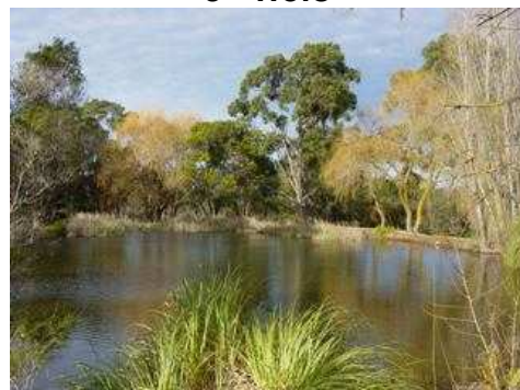
18 th Dam