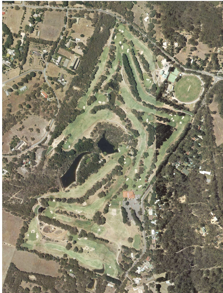
Aerial Shot of Course