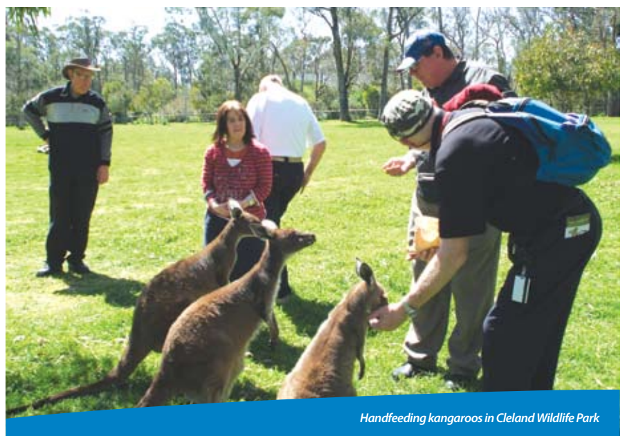
Handfeeding kangaroos in Cleland Wildlife Park

If you would like to learn more about this initiative, please contact Retirement Lifestyle Services on 8422 6294.