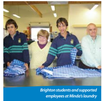
Brighton students and supported employees at Minda's laundry

The school is keen to build on this initiative with Minda into the future.