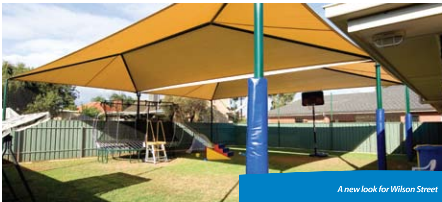
A new look for Wilson Street

Barbeques, backyard cricket and the Hills Hoist collectively conjure up an affable stereotype of a typical Aussie backyard.