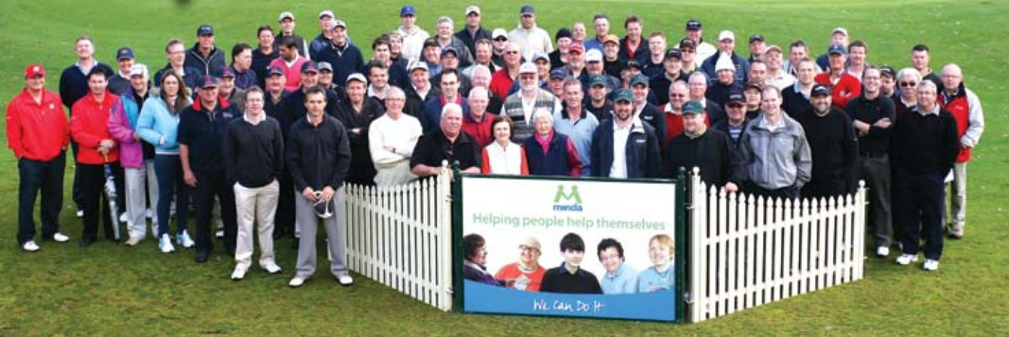
The 2009 Minda Corporate Golf Challenge participants

Do you have a swing in your step and would rather be on the fairway than the freeway?