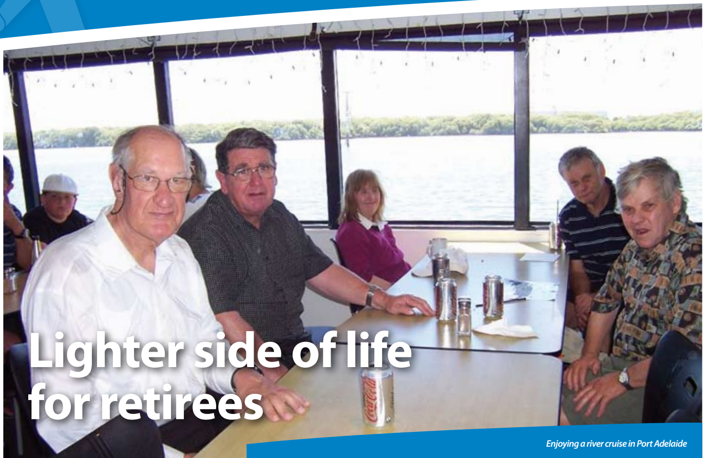
Enjoying a river cruise in Port Adelaide

Some people may view the prospect of retirement as 'winding down', however, a group of individuals has been exploring Adelaide and its surrounds, debunking that myth and thoroughly enjoying themselves in the process!