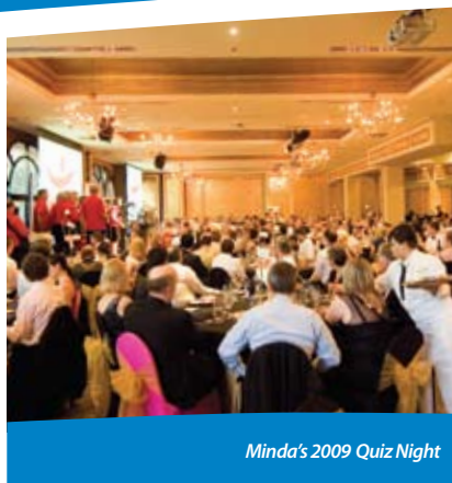
Minda's 2009 Quiz Night

Minda is thrilled that this year's event will be hosted by media personality, Brenton Ragless. The Black Tie Quiz Night raises much needed funds for Minda, with all proceeds raised going towards furnishing new community homes, facilitating greater inclusion and community integration for people with intellectual disability.